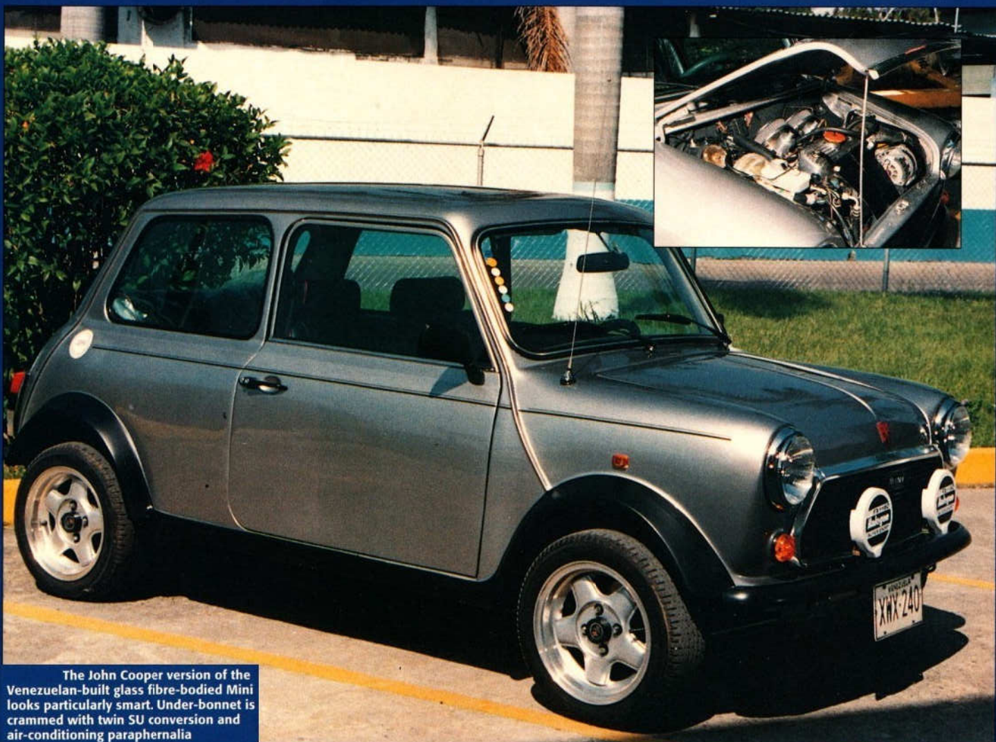
The John Cooper version of the Venezuelan-built glass fibre-bodied Mini looks particularly smart. Under-bonnet is crammed with twin SU conversion and air-conditioning paraphernalia