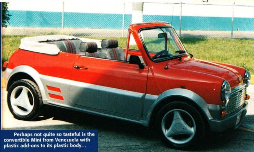
Perhaps not quite so tasteful is the convertible Mini from Venezuela with plastic add-ons to its plastic body...