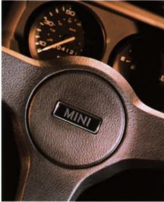
The sporty three-spoke steering wheel adds to the appeal of the driver's cabin.

There's nothing to beat the Mini for fun. There's nothing to match the fashionable Mini Rio.