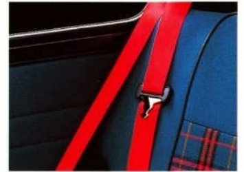
The unique Blue Tartan trim is extrovert and stylish.

Nothing else comes close to the Mini Sidewalk. Drive one soon.