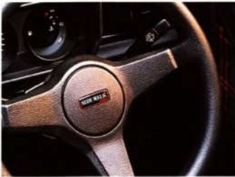
The steering wheel bears the exclusive Mini Sidewalk badge.

Choose the look. It comes in Kingfisher Blue or Charcoal metallic (at no extra cost). Or cool White Diamond. The Mini Sidewalk is unique, from the bonnet badge to the special decals.