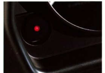
The alarm system includes an engine immobiliser with passive arming.