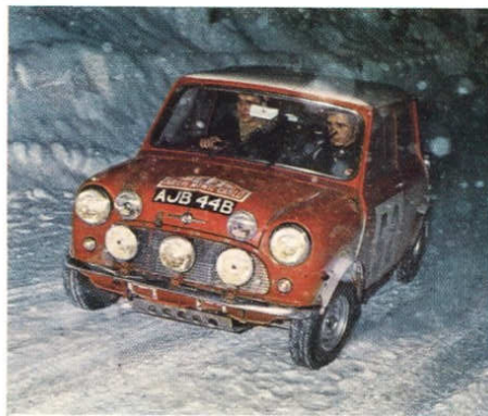
Fabulous Mini Cooper S: Monte Carlo winner, 1964 and 1965

This experience has led to significant advances in suspension, roadholding, comfort and safety. When you buy BMC, you get a car that knows all about accelerating, cornering and braking. Virtues which are as essential in competition as they are on the open road.